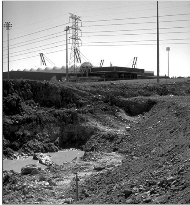
"Remediation" of toxic wastes underway prior to construction of the Olympic grounds.

The new village design, unveiled in 1995, was touted as environmental because it used solar technology, even