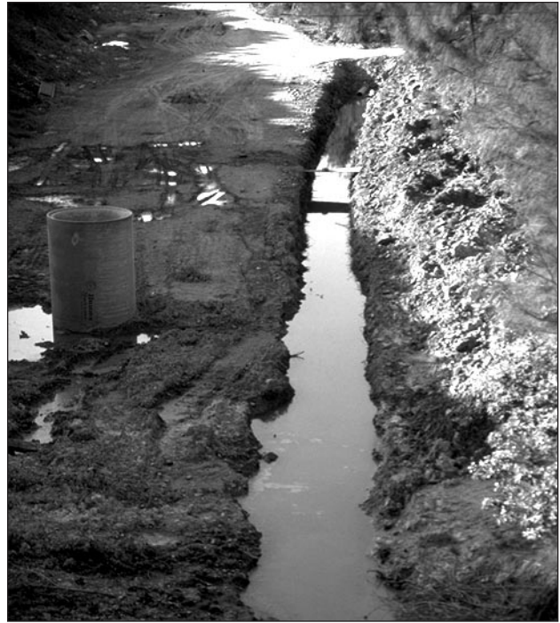
Construction of a leachate drain for waste at Homebush Bay.

The Beijing strategy involved covertly funding a human rights group to campaign against China’s human rights abuses in the lead up to the Games decision. The campaign was to be based in Europe or the United States to divert suspicion from Australia. A book was to be published on the same topic, and “an eminent international identity” would be paid to have his name on the book. A story would also be “planted” in the London Times