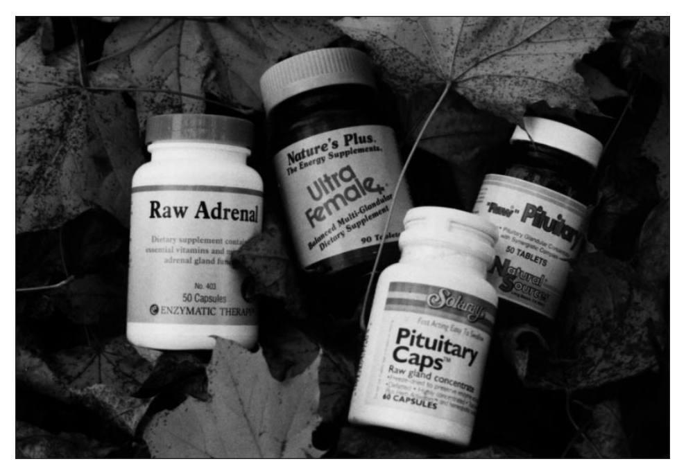
Healing or hurting? These products, sold in health food stores, are all made from the bovine body parts that scientists consider most likely to contain infectious levels of the agent that causes mad cow disease.

There is no scientific proof that you will derive any health advantage from consuming these particular animal glands, and they could well kill you if the cow they came from had a transmissible spongiform encephalopa-